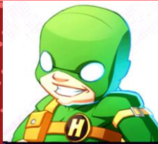
BOB, AGENT OF HYDRA