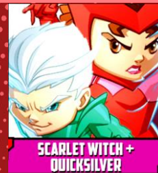
SCARLET WITCH + QUICKSILVER