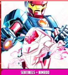
SENTINELS + NIMROD

Nimrod was the powerfully advanced prototype of the mutant-hunting Sentinels. His programming allowed him to read the abilities of foes and make modifications in order to beat them. He fought many mutants in both the X-Men and the Hellfire's Inner Circle. After meeting Sentinel Master Mold, the powerful force absorbed Nimrod and Bastion was born, wreaking even more havoc on the X-Men.