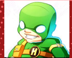
BOB, AGENT OF HYDRA

REAL NAME: Robert Dabalina Deadpool's sidekick Bob was goaded into joining Hydra by his wife who berated him for not having a steady job. Having met Deadpool on one of his Hydra missions, he was convinced to turn away from the evil corporation and help Deadpool instead. As an honorary member of Agency X, he worked with them as best he could since he had no powers or abilities.