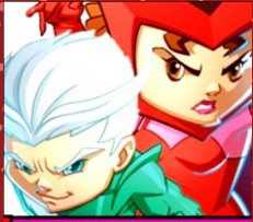
SCARLET WITCH + QUICKSILVER

SCARLET WITCH REAL NAME: Wanda Maximoff After being kidnapped as babies by the High Evolutionary, Wanda Maximoff and her twin brother Pietro were experimented on and later returned to their family. Wanda discovered her ability to create fire with her mind after setting a neighboring house alight. The villagers dubbed her a "Scarlet Witch" and turned on her. Saved by Magneto, she and her brother joined the Brotherhood of Evil Mutants. Using her ability to manipulate minds, Scarlet Witch infused others with visions of despair, including members of the X-Men. She fought for Magneto until he almost killed Quicksilver in an attempt to end the X-Men. Her allegiance to him crumbled. QUICKSILVER REAL NAME: Pietro Maximoff Pietro Maximoff experienced the same beginnings as his twin Wanda. His strongest ability was the power to run at the speed of sound. Fiercely protective of his sister, he whisked her away when the villagers attacked their camp when their father was caught stealing food. They grew up in hiding, surviving as best they could. After Wanda's fateful fire, Magneto stepped in and rescued them, convincing them to join the Brotherhood of Evil Mutants. Magneto called him Quicksilver and he aided in the plots to destroy the X-Men. When Magneto was bested by Stranger, Quicksilver and Scarlet Witch took the opportunity to quit the Brotherhood.