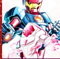
SENTINELS + NIMROD

Nimrod was the powerfully advanced prototype of the mutant-hunting Sentinels. His programming allowed him to read the abilities of foes and make modifications in order to beat them. He fought many mutants in both the X-Men and the Hellfire's Inner Circle. After meeting Sentinel Master Mold, the powerful force absorbed Nimrod and Bastion was born, wreaking even more havoc on the X-Men.